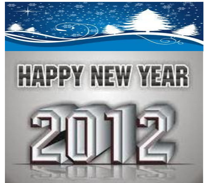
May every day of the New Year grow with good Cheer & Happiness for you & Your Family!